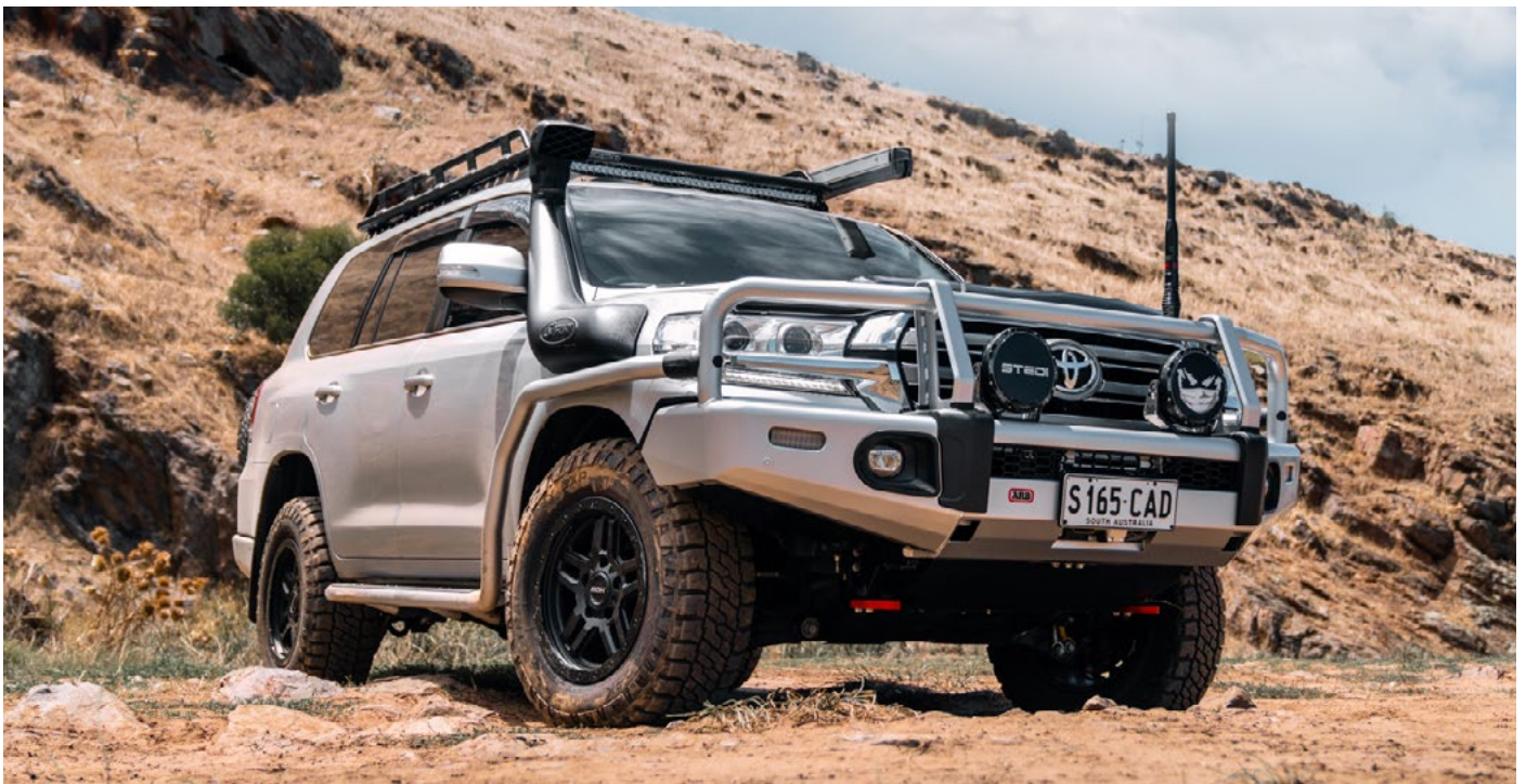
200 Series LandCruiser featuring 18x9 ROH Hammer wheels